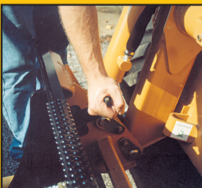
Secure the handles for a solid connection.