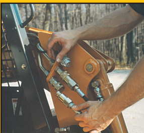
Attach the hydraulic couplers.