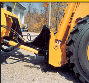
Retract the frame.