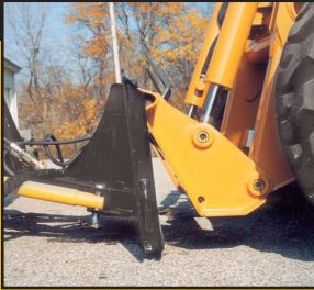
Position the attachment frame underneath the attachment flange.