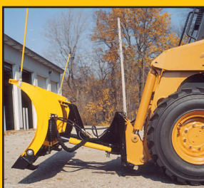
You're ready to work.