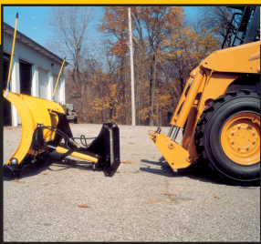
Align the attachment frame with the plow.