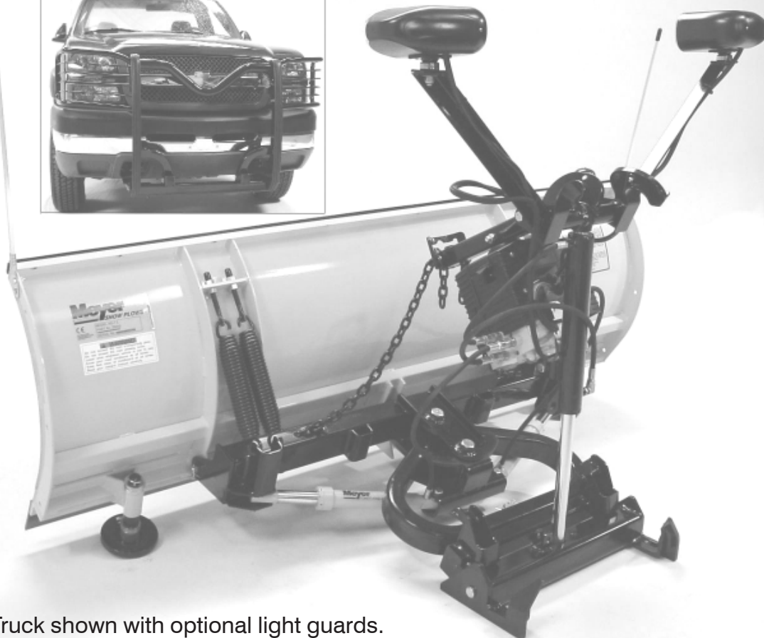
*Truck shown with optional light guards.