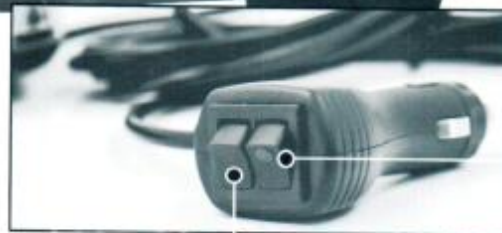
Flash Pattern Selector