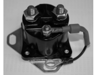
3 Post Motor Solenoid