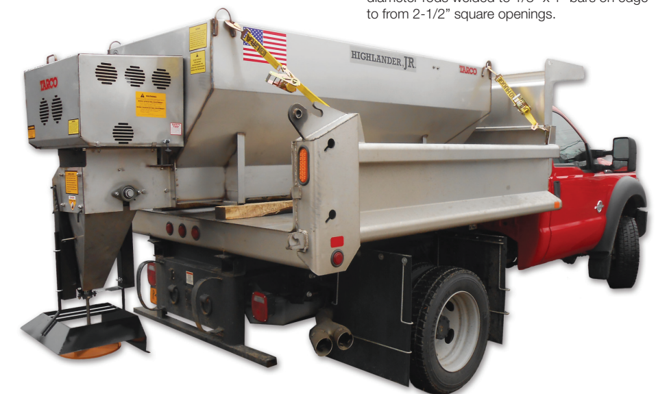
Optional 6" hopper extension shown above

Heavy duty top screens are constructed of 1/4" diameter rods welded to 1/8" x 1" bars on edge to form 2-1/2" square openings.