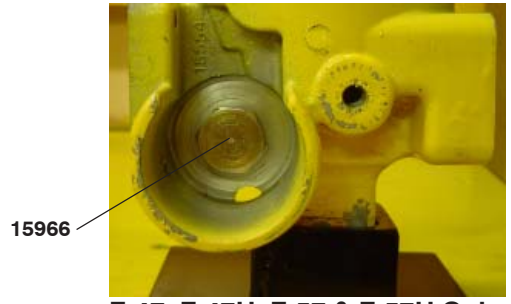
E-47, E-47H, E-57 & E-57H Only

15967 P.A. Block Kit E-47/E-57/E-58/E-60/E-61/E-78